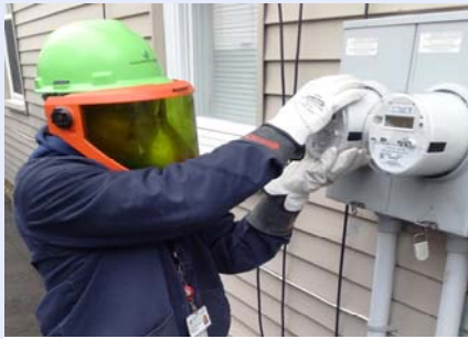
WEI Meter Installer, pictured above installing a new advanced electric meter in PMLP's service territory!

We are happy to announce that we have begun installing new advanced electric meters in our service territory! We will be working in conjunction with our authorized meter exchange vendor, Wellington Energy, Inc. (WEI) to complete the meter exchanges.