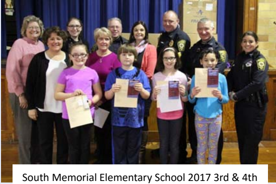
South Memorial Elementary School 2017 3rd & 4th Grade Red Ribbon Week Winners.