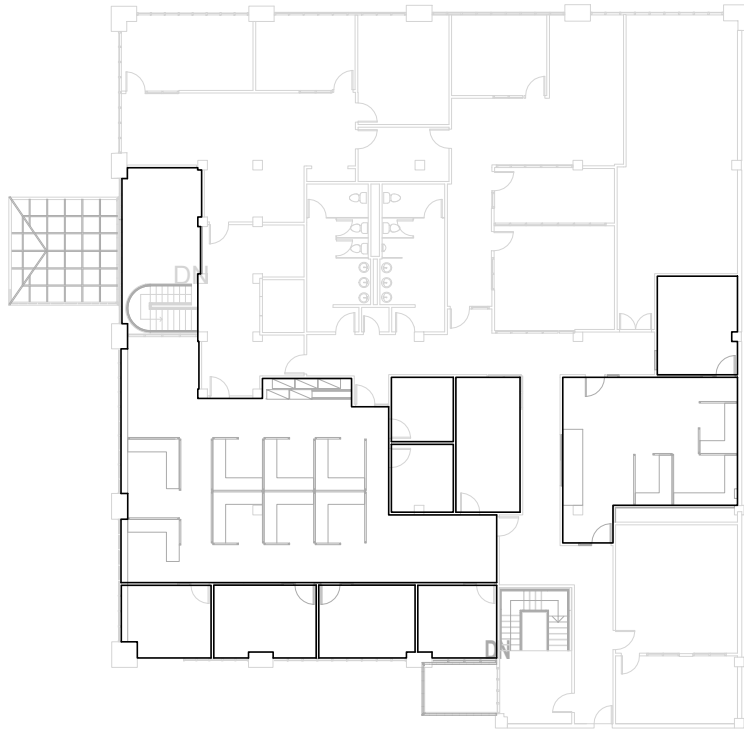
② 2ND FLOOR PAINTING PLAN 1" = 30'-0"

DARK BLACK LINE INDICATES WALLS TO BE PAINTED.