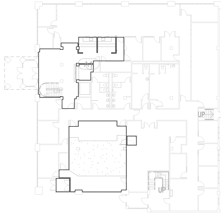
① 1ST FLOOR PAINTING PLAN 1" = 30'-0"

PROPOSED PAINTING RENOVATION/IMPROVEMENT PROJECT PEABODY MUNICIPAL LIGHT PLANT